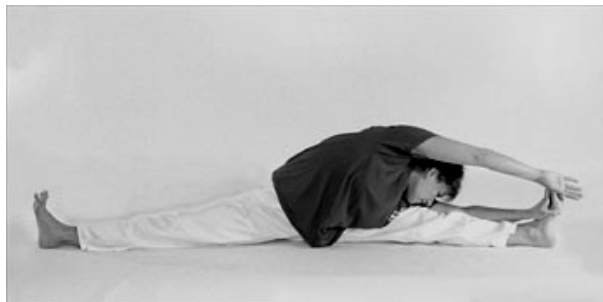
A stretching exercise practiced in the Sennin Foundation Center's Japanese yoga program