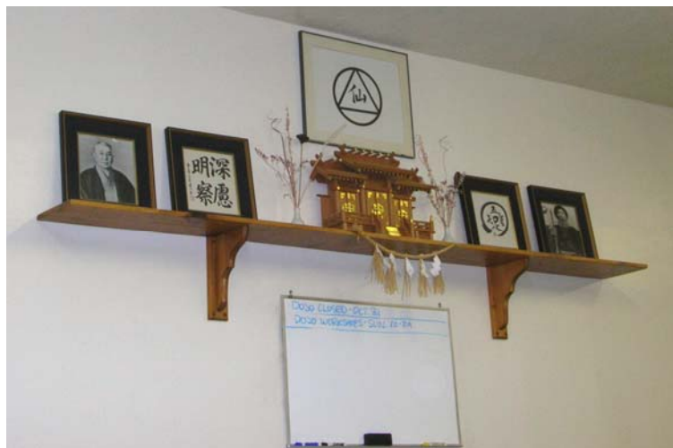
The kamidana of the Sennin Foundation Center

Davey Sensei’s Japanese calligraphic art was accepted out of 10,000 entries to be included in the Sankei Shodo Ten , an art exhibition sponsored by the Sankei newspaper and one of the largest and most important exhibitions of Japanese brush calligraphy in the world.